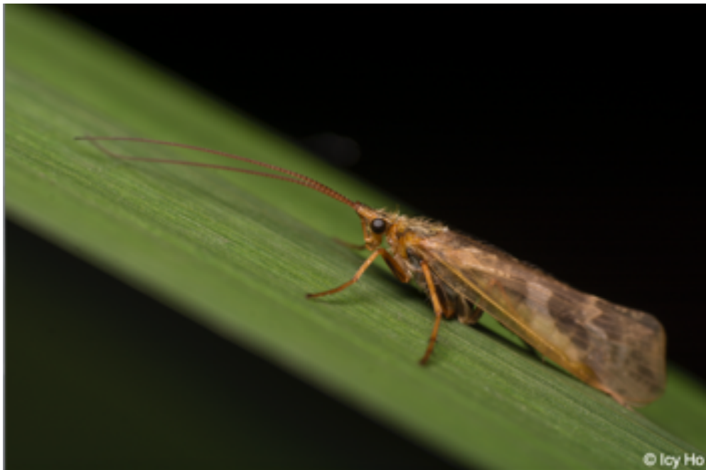
Caddisfly - Limnephilus lunatus by Icy Ho – Highly Commended

Go to and complete the survey: https://consult.environment-agency.gov.uk/environment-and-business/challenges-and-choices/