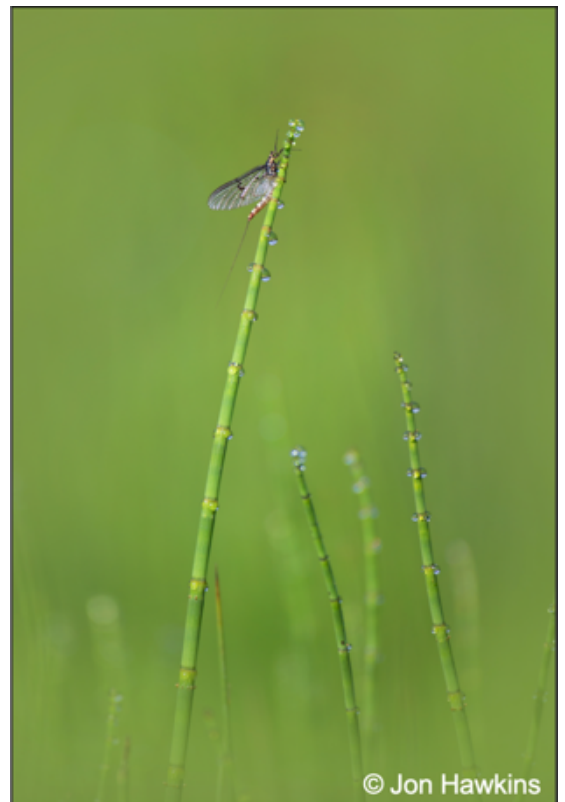
Mayfly by Jon Hawkins – Riverfly Partnership photography competition winner

Tickets for the 5 th Riverfly conference are available via Eventbrite but you will have to move quickly as they are proving popular, with under two months until the event less than a quarter remain. To book your ticket, visit https://www.eventbrite.co.uk/e/riverfly-conference-2020-tickets-80216472629 , we look forward to seeing you there!