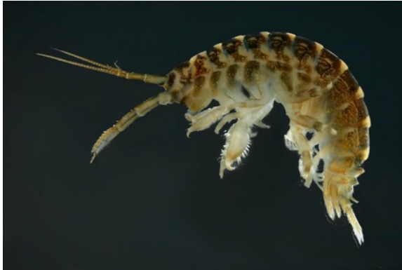
Figure 2. Live specimen of Dikerogammarus villosus.